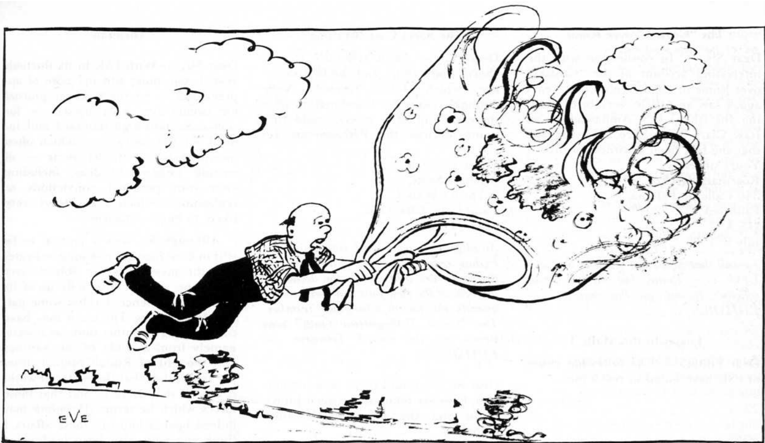
A UFO landing on the South Downs some years ago was explained officially as due to an attempt by someone to burn a carpet.